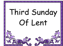
Third Sunday Of Lent