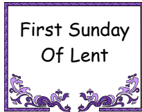
First Sunday Of Lent