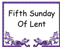
Fifth Sunday Of Lent