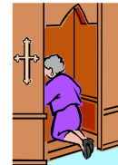
_____ 's First Confession