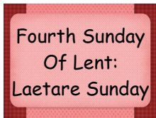
Fourth Sunday Of Lent: Laetare Sunday