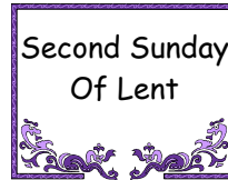
Second Sunday Of Lent