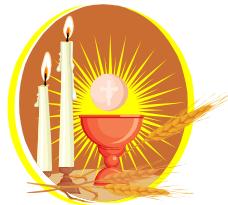
_____ 's First Holy Communion!