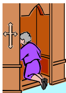
Go To Confession